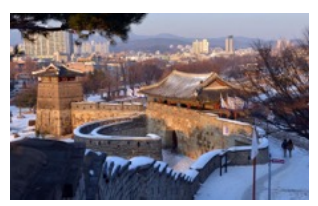
View of a Suwon fortress